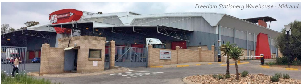
Freedom Stationery Warehouse - Midrand

TecsaReco continues to prepare for a go live scheduled for the end of February. APL Cartons in Worcester are now live on the PO receiving and put away processes and plan to go live in the factory in the third week of March. MetraClark are currently labeling their